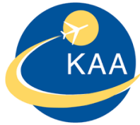
Kenya Airport Authority

We wish to thank the following organisations which facilitated this conference: