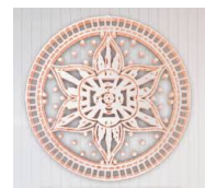
All Saints Cathedral