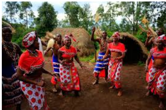
Bomas of Kenya